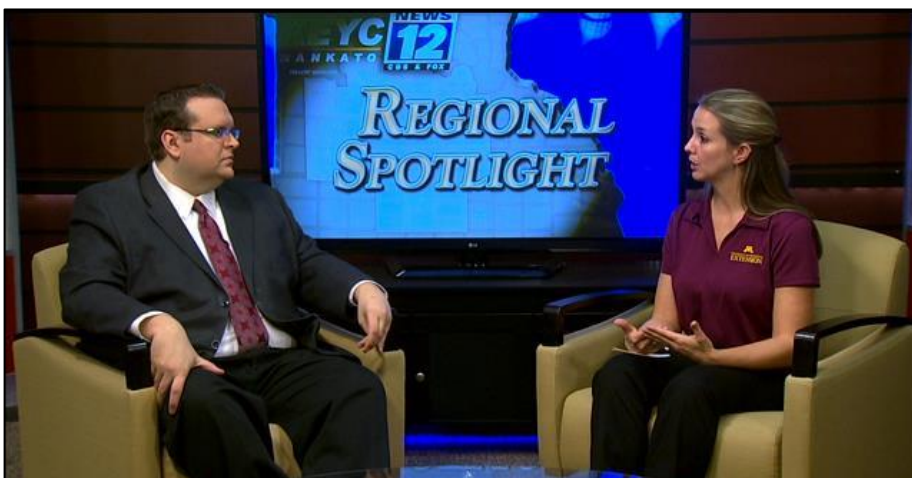
The Extension Educator - Conservation Agronomist discusses an upcoming Cover Crop Walk-n-Talk on the KEYC News 12 Regional Spotlight Segment.

The GBERBA Conservation Agronomist, Le Sueur Watershed Technician, and Watonwan Watershed Technician positions served to reduce nonpoint source pollution in the Greater Blue Earth River Basin through elevated levels of assistance, education, and outreach. Each position worked with local counties/SWCDs to deliver conservation through demonstrations, tours, news releases, radio and TV broadcasts, presentations, brochures, letters, and face-to-face interactions with basin residents. In addition to working with the local partners, the positions worked with both state and federal professionals to help inform the public on current conservation opportunities and programs.