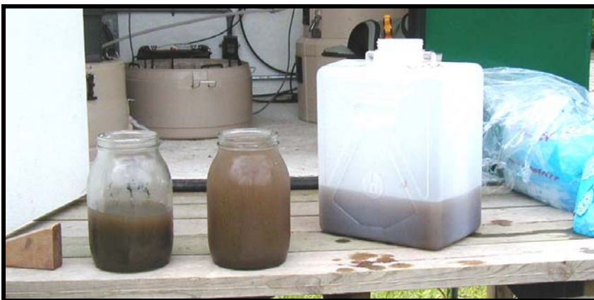
Samples collected from the Le Sueur River during a May 2001 storm event.

Because of the high volumes of water in both the Minnesota and Blue Earth Rivers during the 2001 spring floods, the Le Sueur River experienced backwater conditions at the monitoring station in April. However, it was difficult to estimate exactly when and how long these conditions occurred. When in doubt, USGS data were used to generate valid flow measurements.