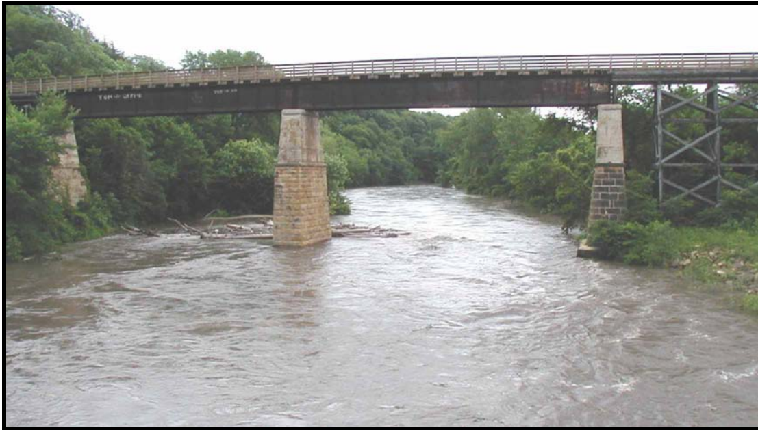
Table 1.LE. Le Sueur River Monitoring Station Information

Station Address: State Highway 66 Bridge, Mankato, MN 56001 County: Blue Earth Major Basin: Minnesota River Basin Watershed: Le Sueur River Drainage Area: 1,100 square miles