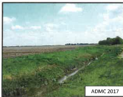
Saturated Buffer (Std. 604)