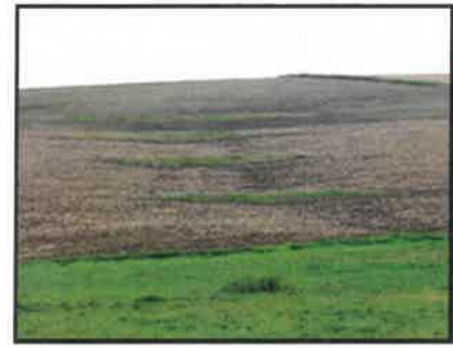
Water & Sediment Control Basin (Std. 638)