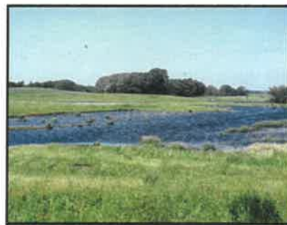
Wetland Restoration (Std. 657) or Impoundment