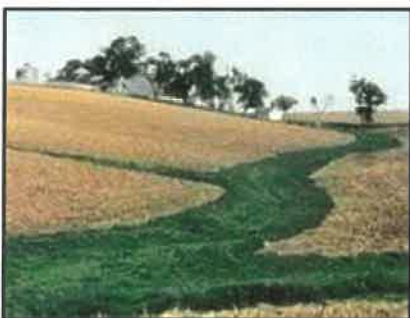
Grassed Waterway (Std. 412)