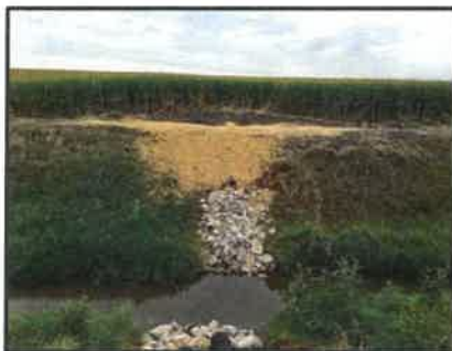
Side Inlet to a Ditch (NRCS FOTG Std. 410)